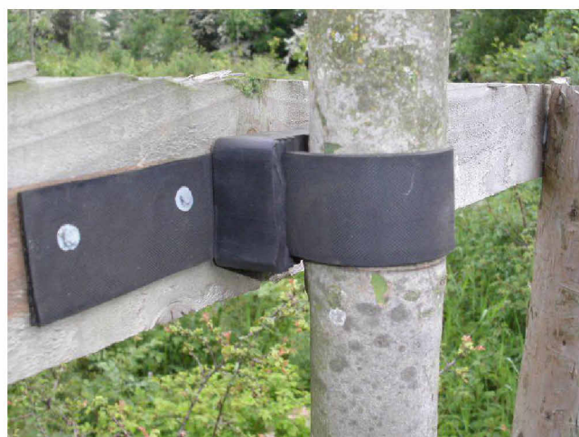
REFERENCE IMAGE: TREE STAKING SYSTEM

NOTE ALL DIMENSIONS TO BE CHECKED ON SITE NO DIMENSIONS TO BE SCALED FROM THIS DRAWING THIS DRAWING IS TO BE READ IN CONJUNCTION WITH RELEVANT CONSULTANTS DRAWINGS NO PART OF THIS DOCUMENT MAY BE RE-PRODUCED OR TRANSMITTED IN ANY FORM OR STORED IN ANY RETRIEVAL SYSTEM OF ANY NATURE WITHOUT THE WRITTEN PERMISSION OF THE LANDSCAPE ARCHITECT AS COPYRIGHT HOLDER EXCEPT AS AGREED FOR USE ON THE PROJECT FOR WHICH THE DOCUMENT WAS ORIGINALLY ISSUED SHOP DRAWINGS TO BE SUBMITTED, WHERE REQUIRED AND REQUESTED, FOR APPROVAL