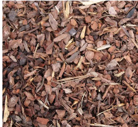
REFERENCE IMAGE: BARK MULCH