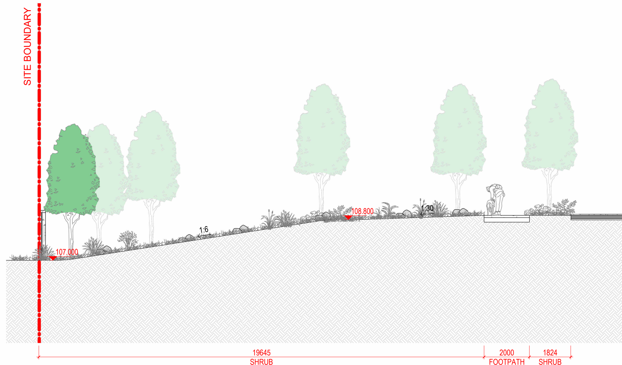
24 SECTION 24 SCALE: 1 : 100 @A1