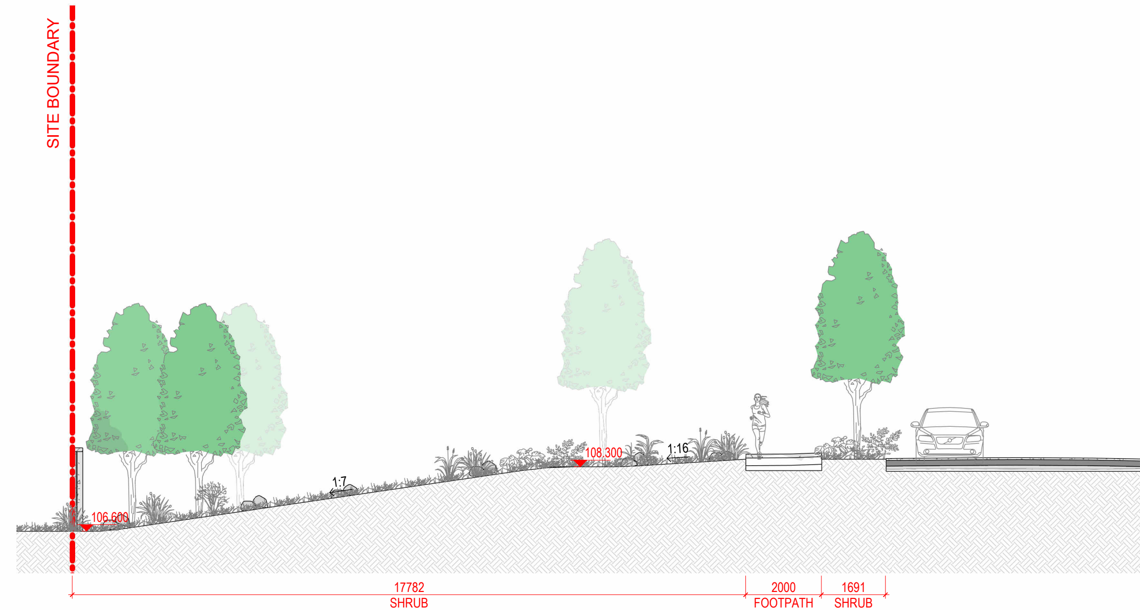
23 SECTION 23 SCALE: 1 : 100 @A1