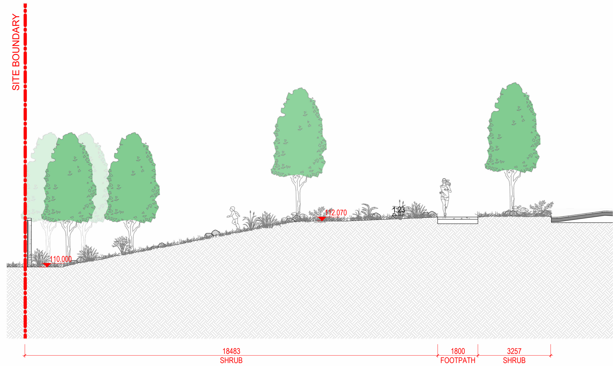
26 SECTION 26 SCALE: 1 : 100 @A1

NOTE ALL DIMENSIONS TO BE CHECKED ON SITE NO DIMENSIONS TO BE SCALED FROM THIS DRAWING THIS DRAWING IS TO BE READ IN CONJUNCTION WITH RELEVANT CONSULTANTS DRAWINGS NO PART OF THIS DOCUMENT MAY BE RE-PRODUCED OR TRANSMITTED IN ANY FORM OR STORED IN ANY RETRIEVAL SYSTEM OF ANY NATURE WITHOUT THE WRITTEN PERMISSION OF THE LANDSCAPE ARCHITECT AS COPYRIGHT HOLDER EXCEPT AS AGREED FOR USE ON THE PROJECT FOR WHICH THE DOCUMENT WAS ORIGINALLY ISSUED SHOP DRAWINGS TO BE SUBMITTED, WHERE REQUIRED AND REQUESTED, FOR APPROVAL