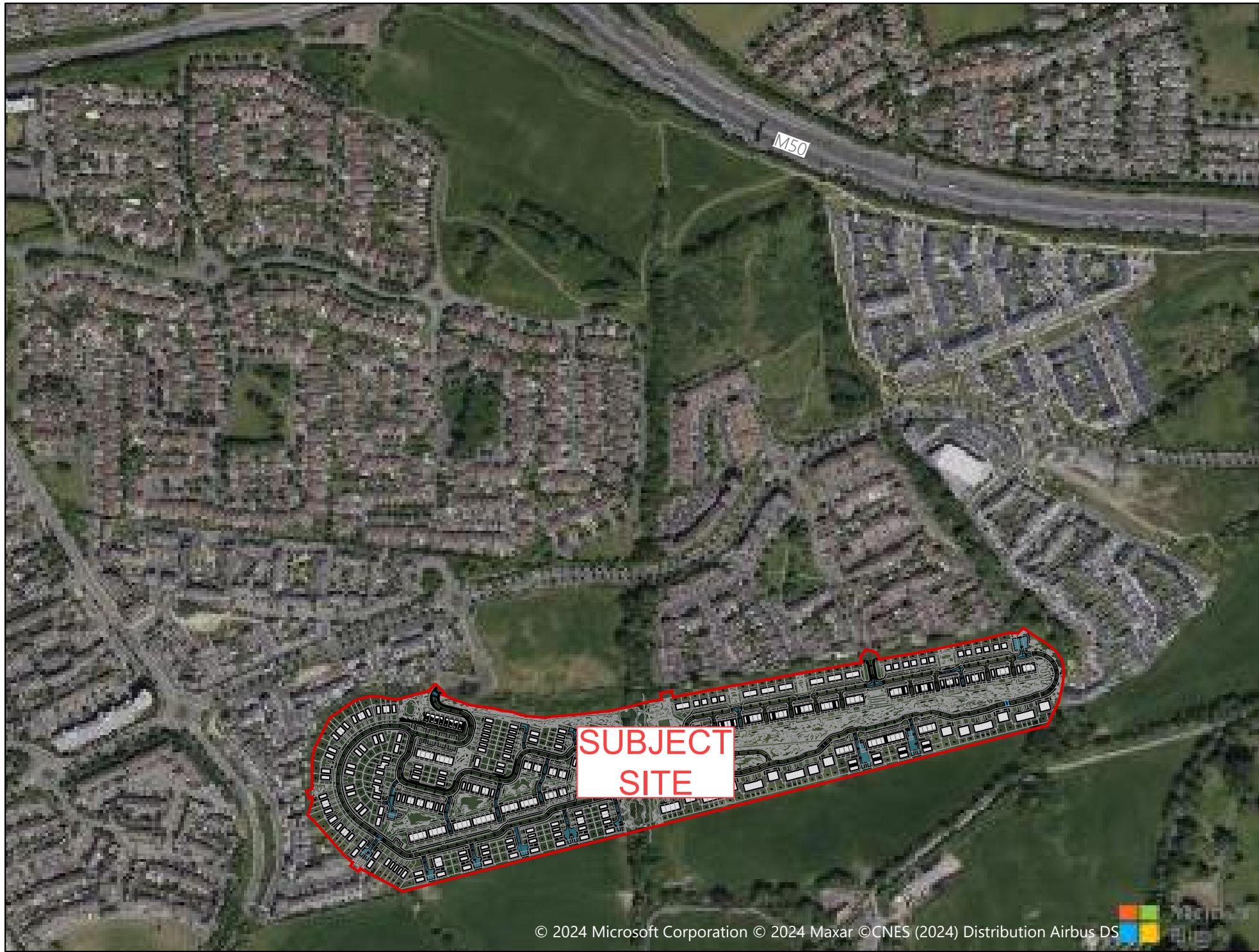
SITE LOCATION MAP N.T.S