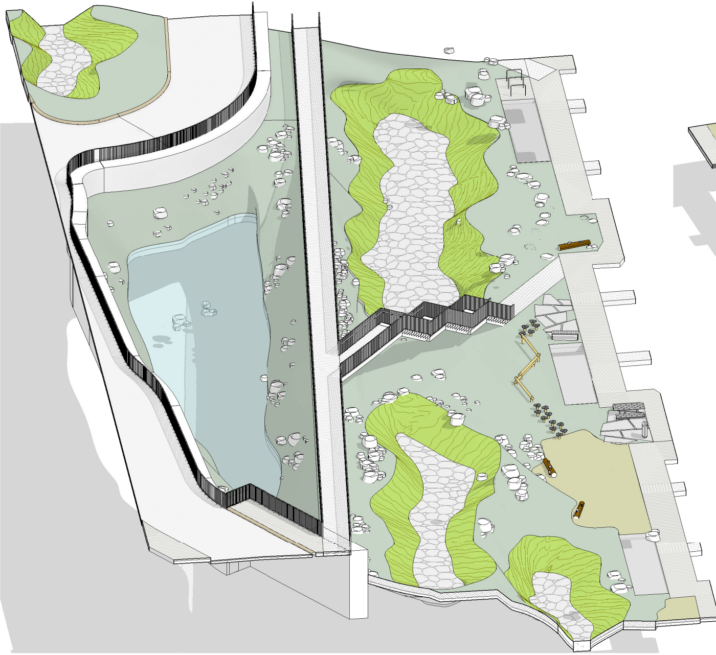
2 POND C - 3D VIEW 1 SCALE: @A1