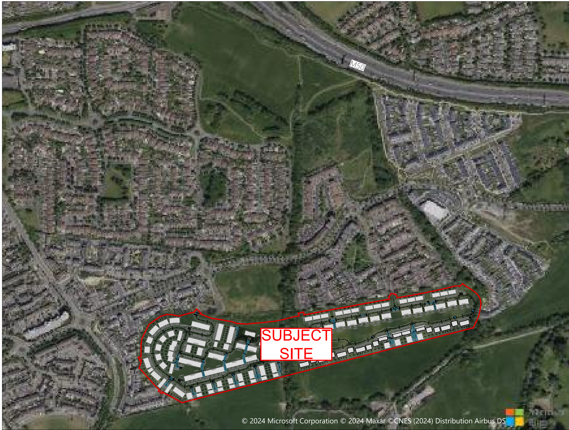
SITE LOCATION MAP N.T.S